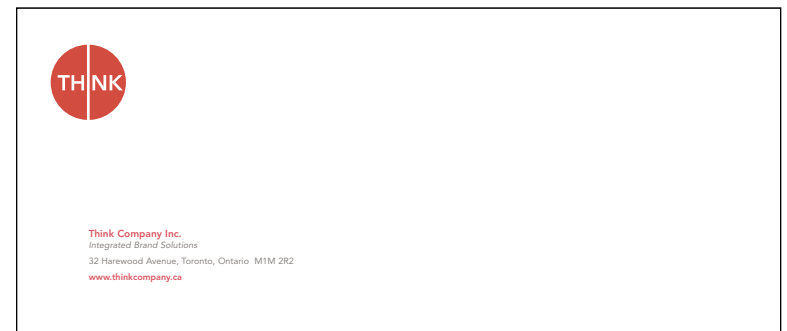
No. 10 Envelope (Front)