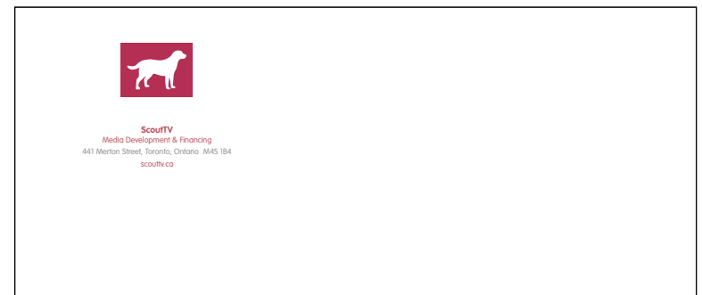
No. 10 Envelope (Front)