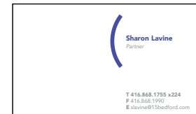
Business Card (Front & Back)