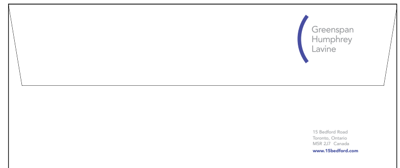
No. 10 Envelope (Back)