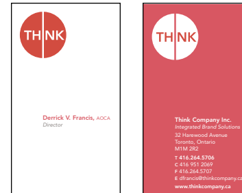
Business Card (Front & Back)