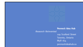
Business Card (Front & Back)