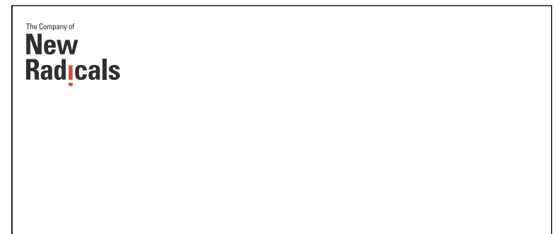
No. 10 Envelope (Front)